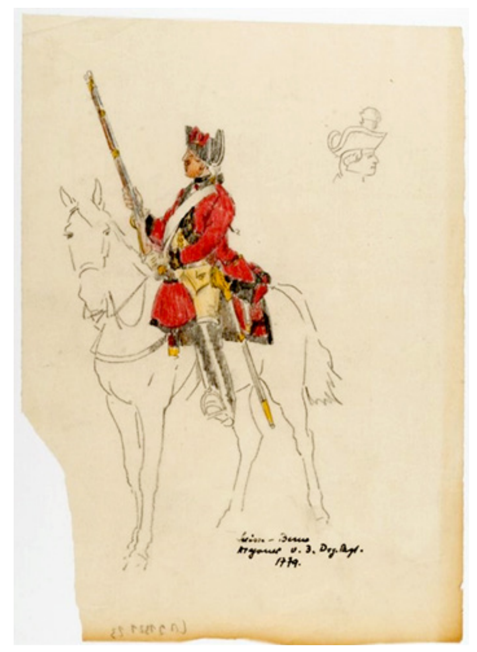
Fig. 4 – Berne Dragoner , 1779 inv. LM-91321.23