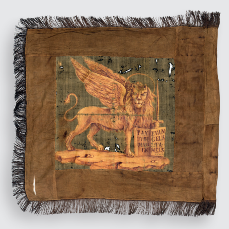
Società Italiana di Storia Militare