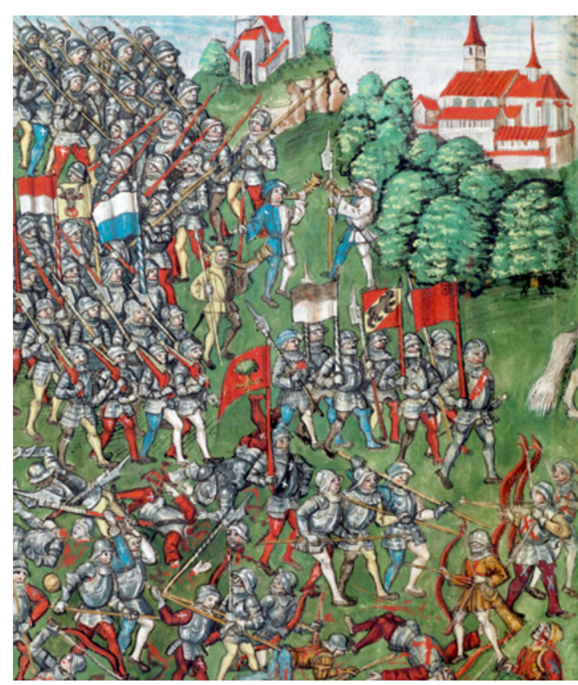
Fig. 1. Battle of Grandson, Habsbourg Knight at the Centre. From the Eidgenössische Chronik by Diebold Schilling of Lucerne (Luzerner Schillling). Luzern, Korporation