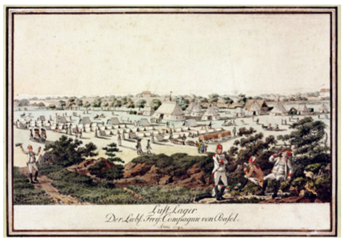
Fig. 5 – Manoeuvre Camp of the Basle Free Company, 1791 Colourised etching, 1791 Courtesy Swiss National Museum, inv. LM-44771

essential element in assuring heavy cavalry. The Bernese experience in the Vaud certainly supports this hypothesis. For over a century, Berne drew on the princely feudal structures inherited from the Dukes of Savoy, but Berne's republican nature meant that these feudal structures could not be kept "alive," as the dukes would have done by awarding new fiefs or promoting successors for extinguished family lines. Switzerland also lacked the magnificent stud complexes constructed in the surrounding geography, where princes did not shy to hire Leonardo da Vinci, and the master was not averse to putting his mind to the commissions. These were the