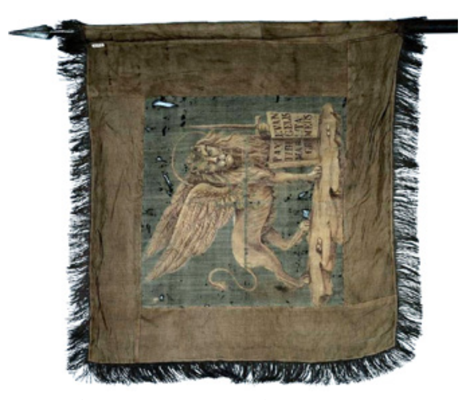
Società Italiana di Storia Militare