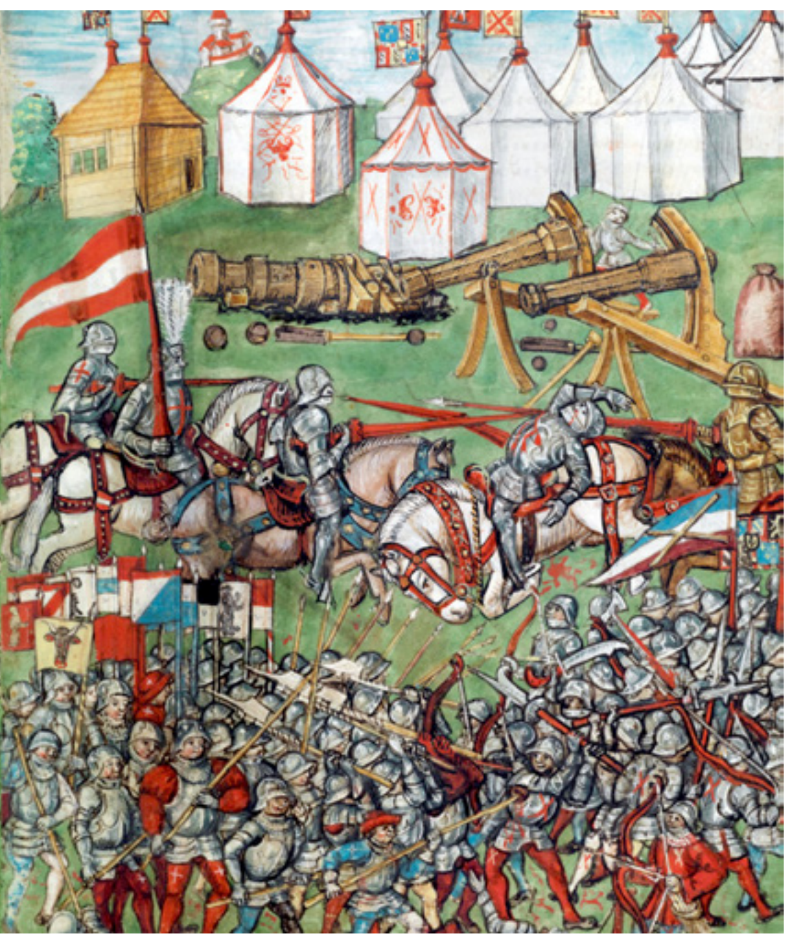
Luzern, S 23 fol. (e-codices, unifr.ch/en/list/one/kol/S0023-2), pp. 200-201 (<a href="https://blog.nationalmuseum.ch/app/uploads/2020/06/grandson-schilling-header.jpg">https://blog.nationalmuseum.ch/app/uploads/2020/06/grandson-schilling-header.jpg</a> CC BY-NC.