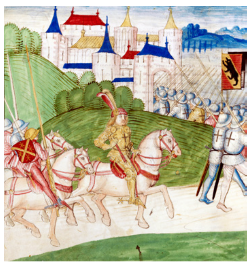
Fig. 2 The Twingherr Petermann von Wabern. Diebold Schilling der Ältere, Amtliche Berner Chronik , vol. 3, Burgerbibliothek Bern, Mss.h.h.I.3 (1478/83), S.490 (e-codices). CC BY-NC

Mounted individuals were also needed for light cavalry roles, e.g. for reconnaissance or to protect logistics. The Bernese Twingherrenstreit of 1469–71 incidentally illustrates the point. The dispute arose because the knights (among them Adrian von Bubenberg, one of the heroes of the Battle of Morat five years later) insisted on their privileges, which Berne's leading Burger , themselves commoners and thus superseded in protocol by their own vassals, found intolerable. In the ensuing stand-off, the common-born privy councillors argued that it had been the