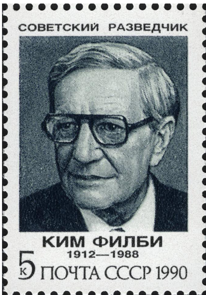
Francobollo sovietico del 1990 in memoria di Kim Philby (1912-1988), ufficiale dell'intelligence service di fede comunista e spia sovietica.